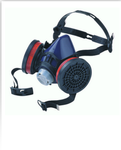
PRODUCT NUMBER: 1001575 Half-mask (Medium)