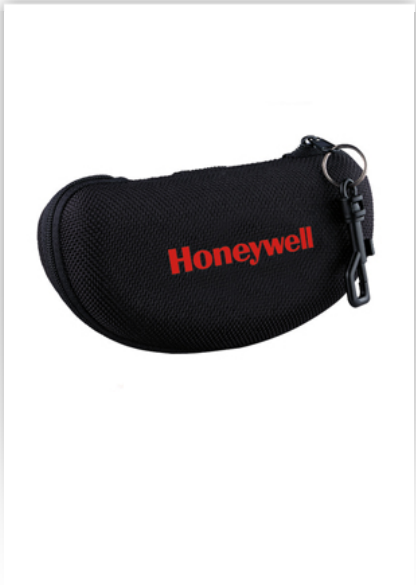
PRODUCT NUMBER: 1013418 Case:Large Rigid Zip w/Beltloop/Snap