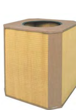
Mobiflex® 200-M Filter