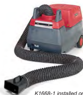
K1668-1 installed on Mobiflex® base unit

Completely flexible extraction hose with magnetic hood set. Ideal for those hard to access fume extraction applications. Hose is reinforced with outside steel rings to protect against wear and crushing. Diameter of hose is 6 in. (160 mm) or 8 in. (205 mm), length is 16.5 ft. (5 m).