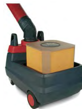
Filter shown inside Mobiflex® 200-M