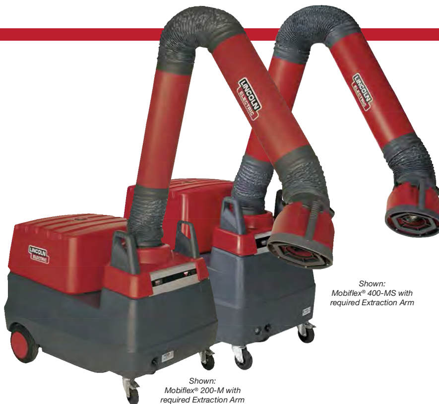
Shown: Mobiflex® 400-MS with required Extraction Arm