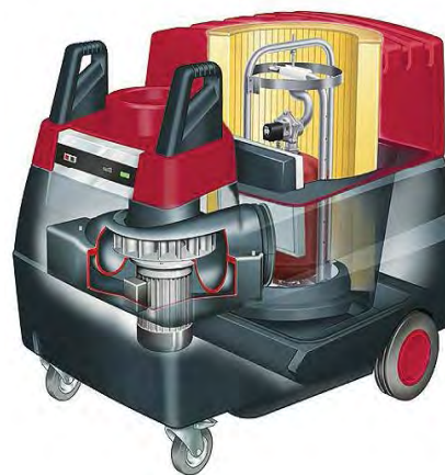
Internal view of Mobiflex® 400-MS showing self-cleaning filter mechanism.